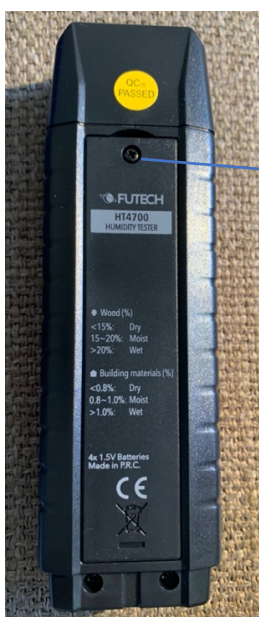
E: Battery cover